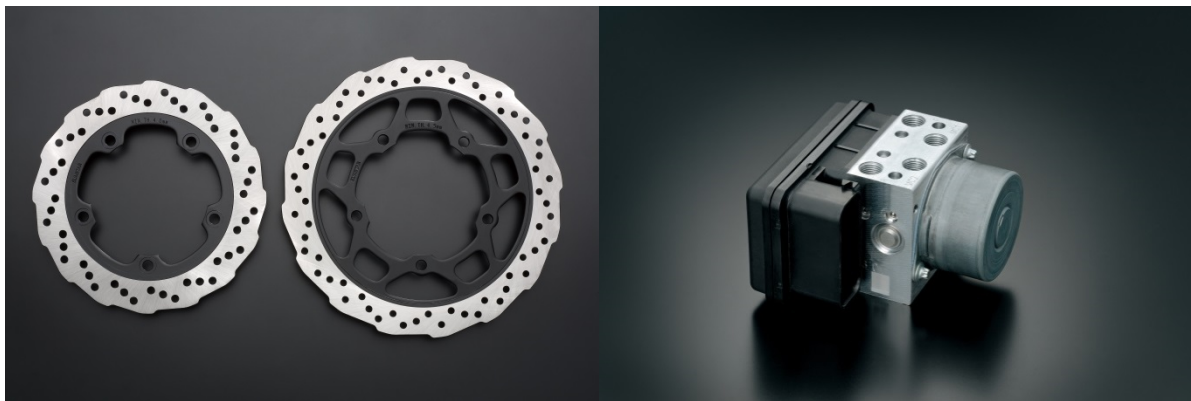
Petal Type Brake Disc