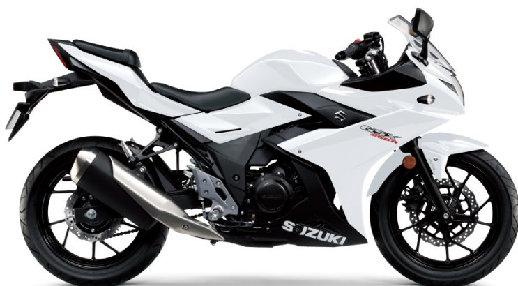
Pearl Glacier White No.2 (QHW)