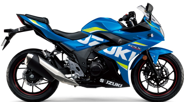
Metallic Triton Blue NO.2 (QHV)