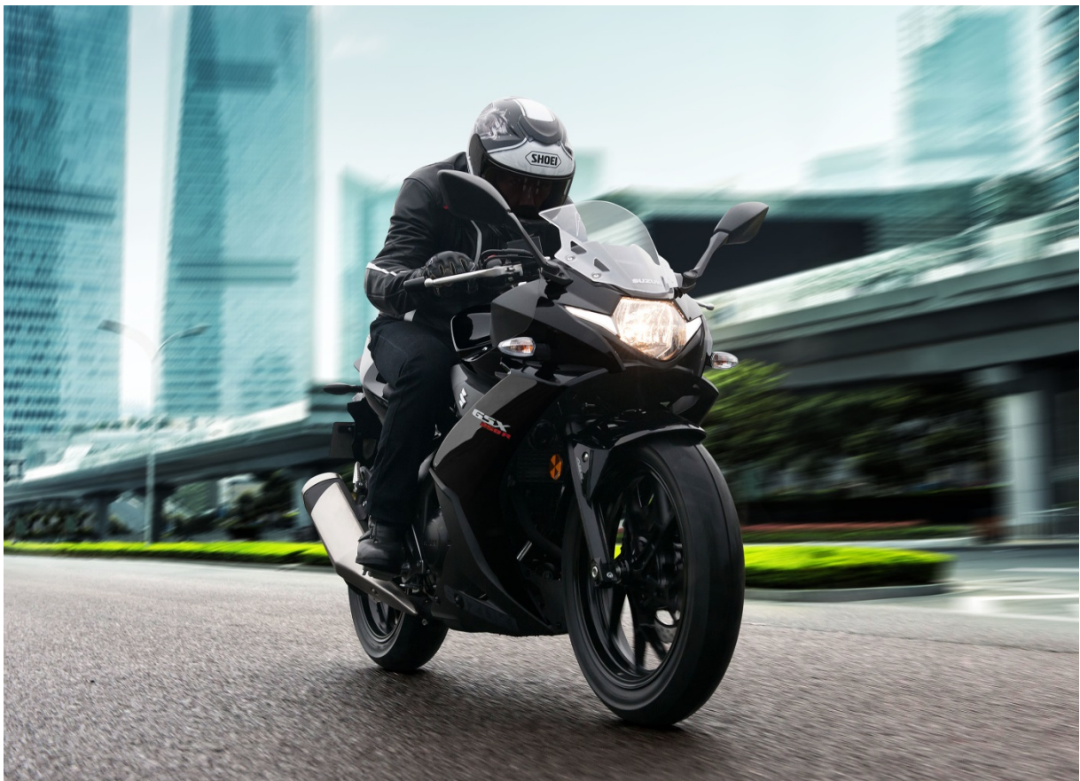
Photo: GSX250R ABS