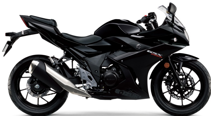
Pearl Nebular Black (YAY)