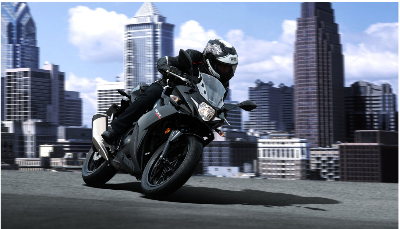
Photo: GSX250R ABS

The new GSX250R/ABS is a perfect choice for a wide range of riders. That includes those who are looking to buy their first sporty street bike, or who are returning to the world of two-wheeled riding pleasure later in life.