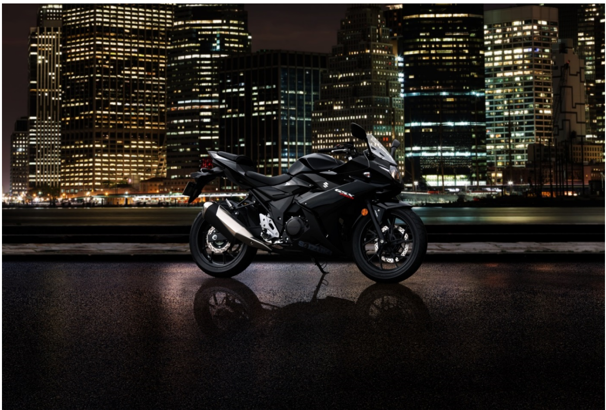
Photo: GSX250R ABS